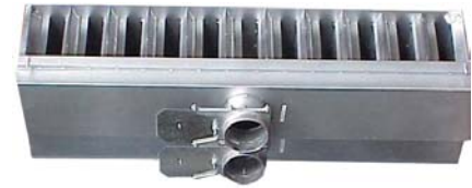
DORTMANN 8000 Nozzle Assembly

The complete Dortmann Drying System includes a Nozzle Assembly, and skid containing the control panel with temperature controller, electric heater, blower and transition ducts to simplify field installation.