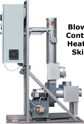
Blower Control Heater Skid